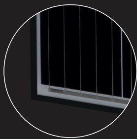
BLACK | WHITE