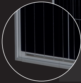
SILVER | WHITE